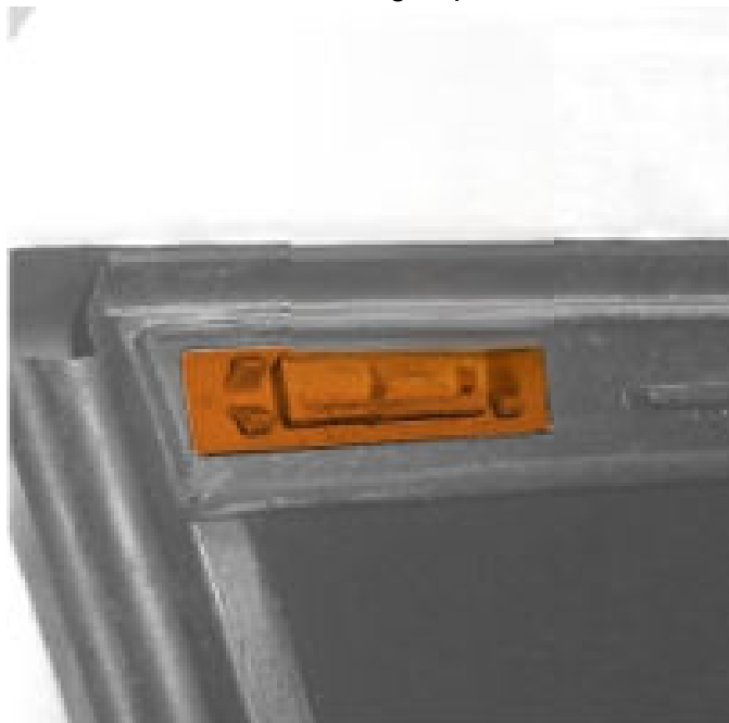
Fig. 4 Seal Clip