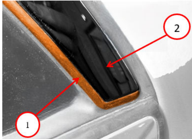
Fig. 7 Trim Installed

NOTE: Ensure the lower lip of the seal has not been pinched by the trim and remains positioned outside the trim Fig. 7 .