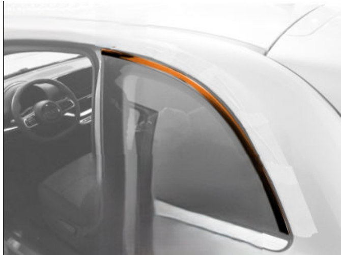
Fig. 5 New Trim In Place

NOTE: First lock the lower profile of the trim followed by the upper profile until it clicks into place.