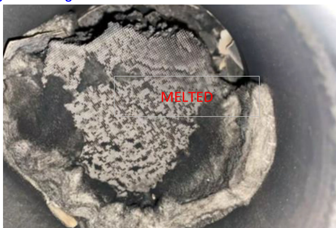
Fig. 3 Melted Catalyst

10. Remove the Upstream Oxygen Sensor and using a borescope, is the catalytic converter internally melted/ cracked or brain pattern Fig. 3 and Fig. 4 ?