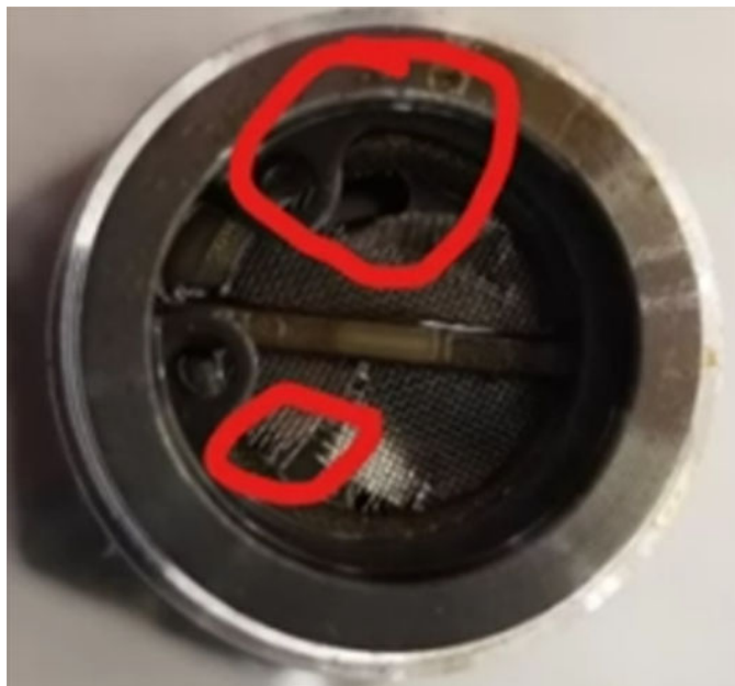
Fig. 2 OCV Filter Torn