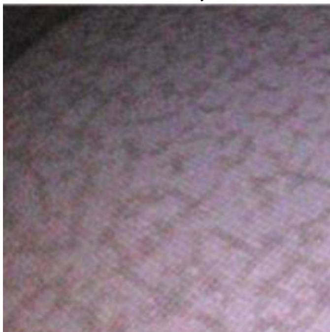
Fig. 4 Brain Pattern