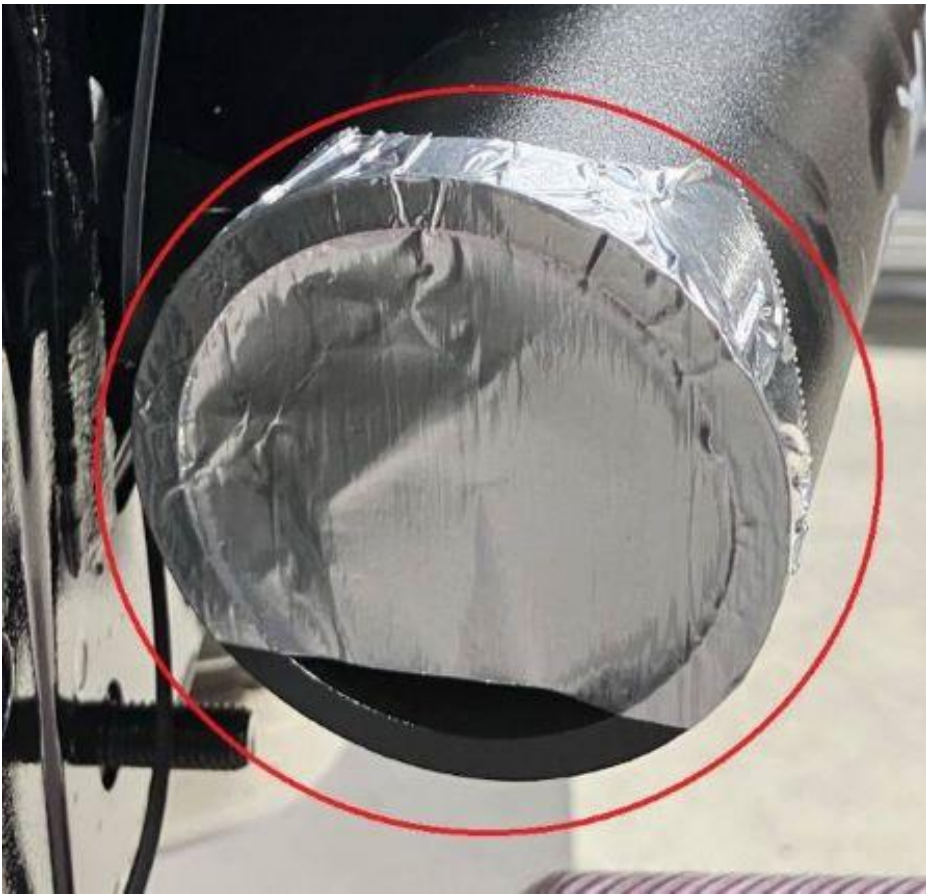
Figure 1. Left side of vehicle with towing bracket, bumper carrier opening sealed off with aluminum adhesive tape.