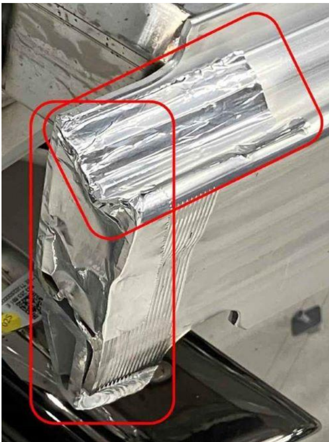
Figure 3. Left side of vehicle without towing bracket, bumper carrier openings (on the side and top) sealed off with aluminum adhesive tape.