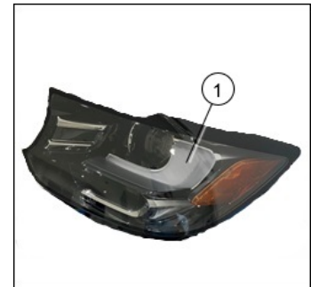
Combination light with AFS (1): Parking light/daytime running light (DRL)

This may be caused by the AFS Control Module detecting a false headlight malfunction. There are 2 causes, both of which will be resolved by software changes expected sometime in the 3rd quarter of 2025.