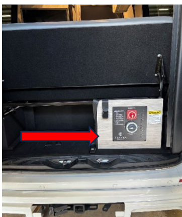
Figure 1C – GT1 Motorhomes