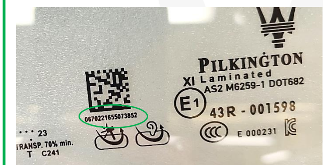
Figure 3: Left Side OK 6702216550xxxxx