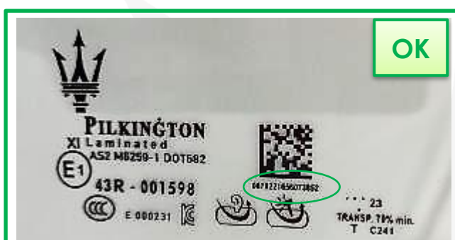
Figure 2: Right Side OK 6702216560xxxxx

Important note: The inspection of the left side is a formality. No issues are expected. However, if a non-conformity is found on this side, open a BOL as "support request" and wait for further instructions.