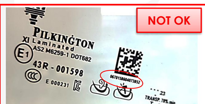
Figure 2: Right Side NOT OK 6701586040xxxxx