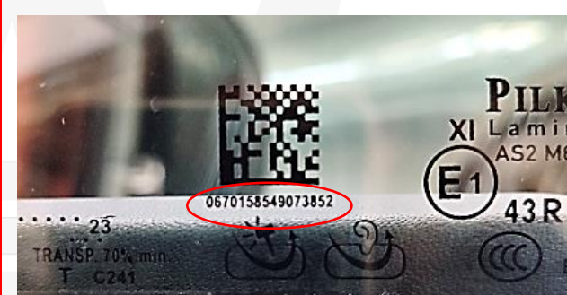
Figure 4: Left Side NOT OK 6701585490XXXXX

→ If the code shown is compliant , no further action is required.