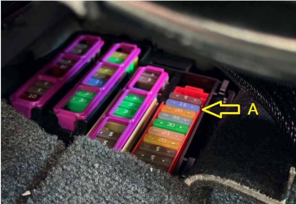
Figure 2. Fuse control panel