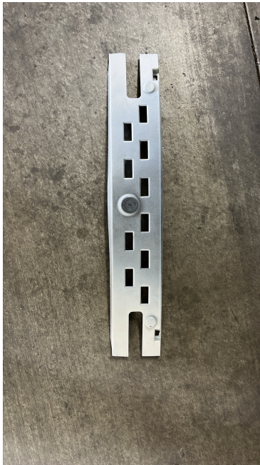
Photo shows the center section of the new front bumper cover that will be removed during installation. This section, if not removed, blocks the FRSF front radar reducing the functionality and causing erroneous behavior.