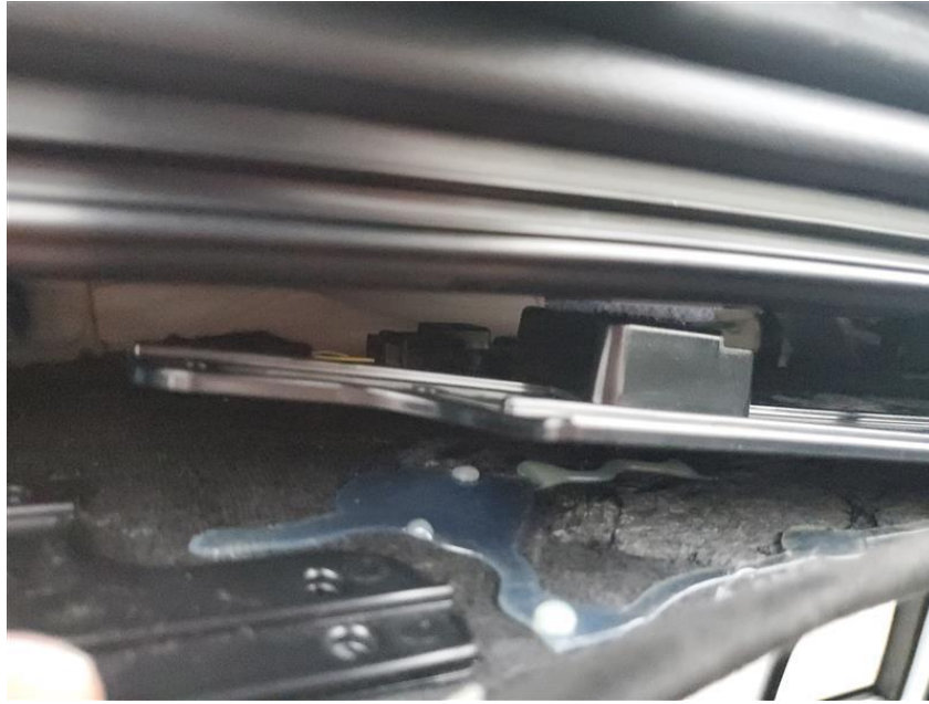
Fig 2 Adhesive Separation