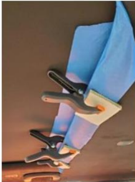
Fig 3 Adhesive Applied And Clamps Used To Secure