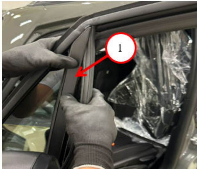
Fig. 5 Press Door Applique To Clips