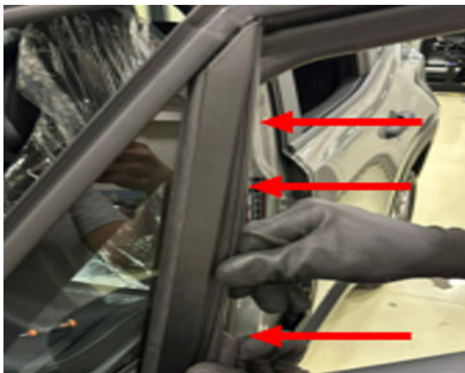
Fig. 6 Install Trim

8. Install and press the trim back in place Fig. 6.