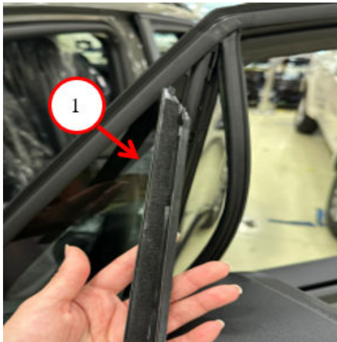
Fig. 2 Remove Door Applique