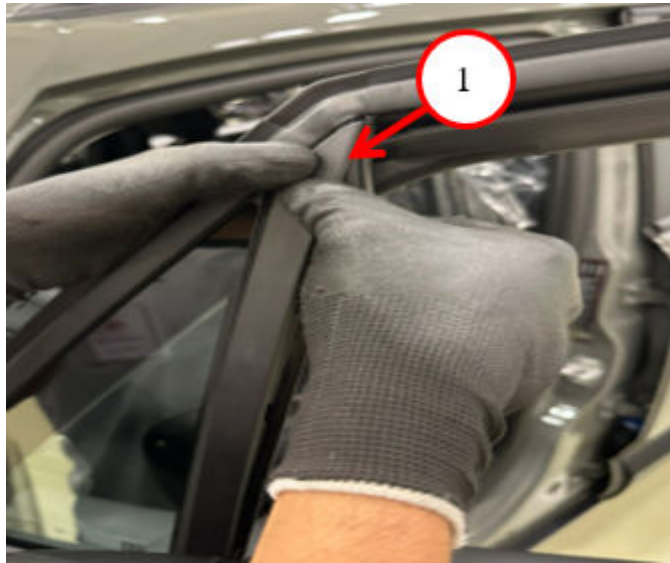
Fig. 4 Clip Door Applique