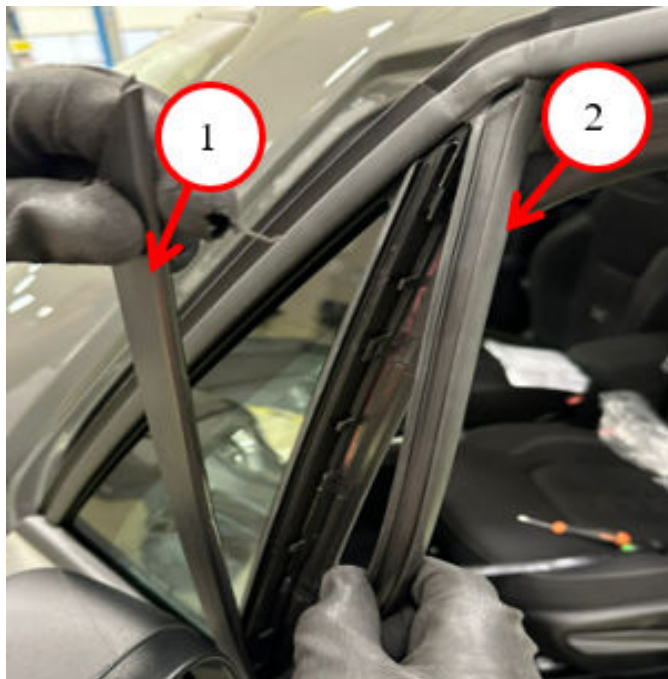
Fig. 3 Insert Door Applique