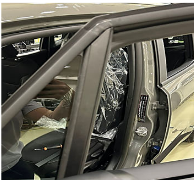
Fig. 7 Properly Installed Door Applique

9. Confirm the door applique is properly installed Fig. 7.