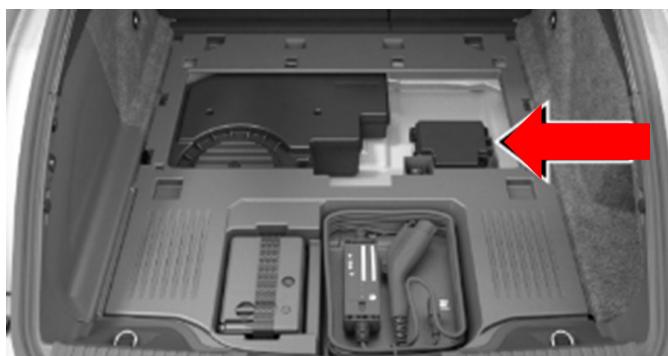
Fig. 2 Rear PDC Location