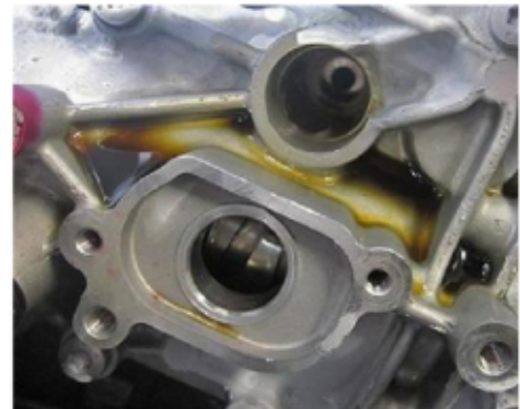
Fault type 2: Cylinder head cover leaking

Create informative photo documentation of the damaged seal and attach it to the process in PCSS.