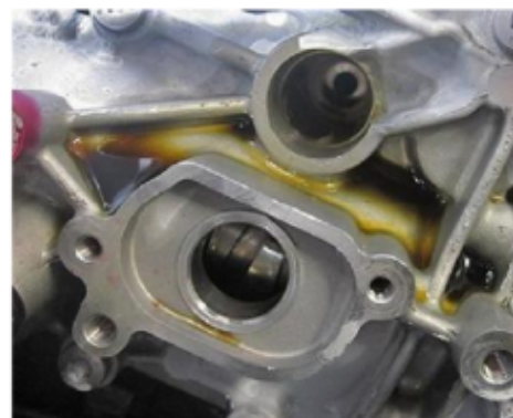
Fault type 2: Cylinder head cover leaking

2.4 To remove cylinder head cover and dispose of old seal, see ⇒ Workshop Manual '158219 Removing and installing cylinder head cover (V6 turbo)' .