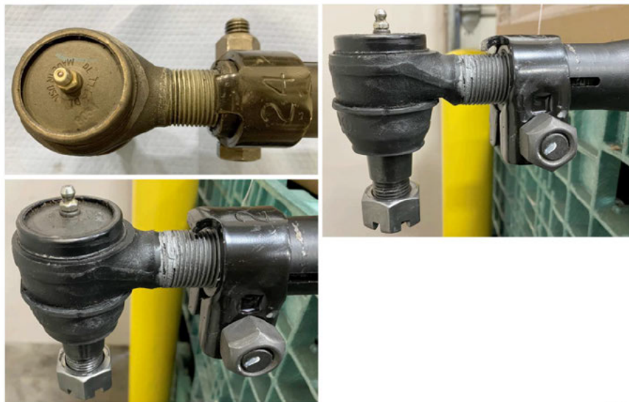
Table 2, TRW Tie Rod Assembly and Tie Rod End Part Numbers