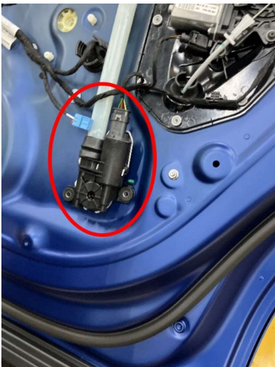
Figure 2 – A close up of detail A from figure 1