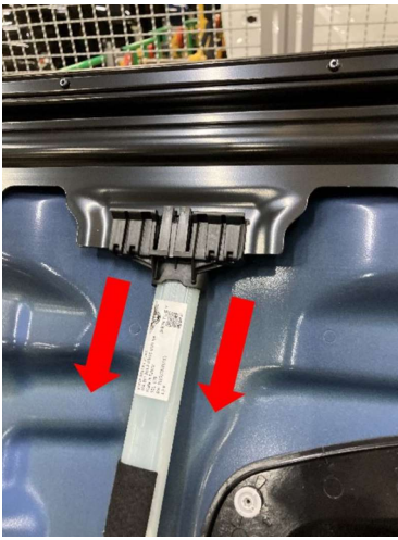
Figure 3 – A close up of detail B from figure 1