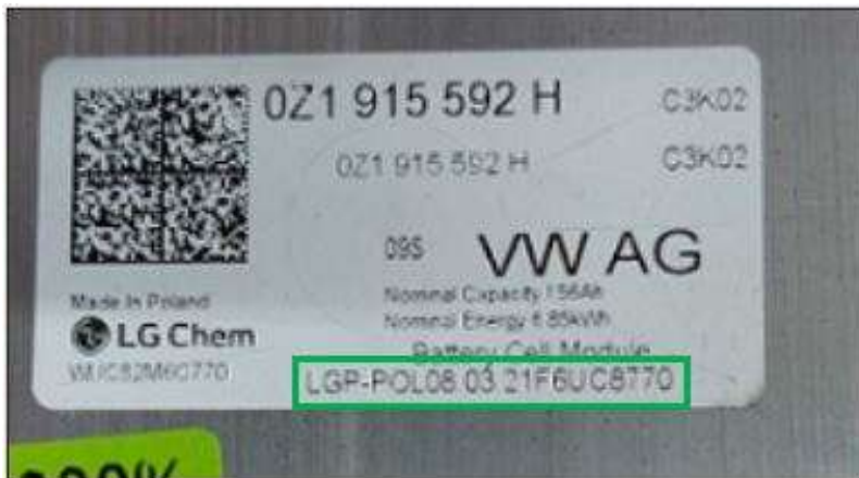
Figure 1. Example image of a battery module type plate with production date: 08 03 21 (= 08.03.2021)