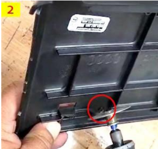
Figure 6. Screw barrel removal.