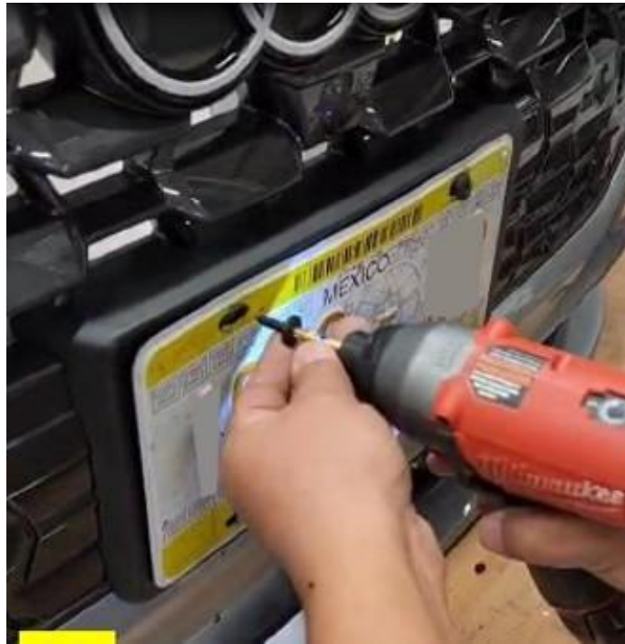
Figure 13. Installing left upper screw through the license plate and into the bracket.