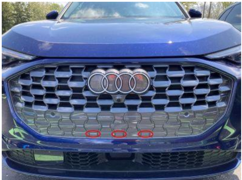
Figure 2. Normal location of grille openings. Openings missing.

The missing front license plate bracket is confirmed. Furthermore, the rectangular openings in the lower portion of the front radiator grille intended to receive the lower tabs of the license plate bracket are also not present.