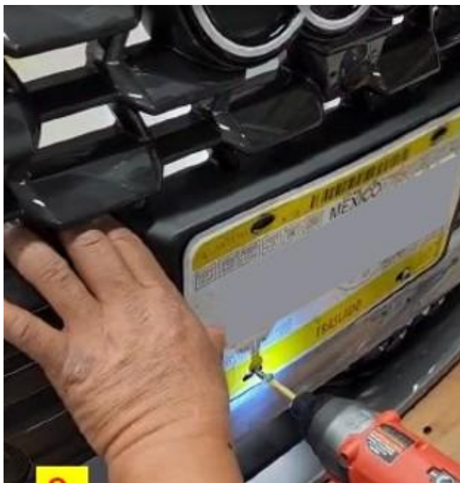
Figure 11. Screwing the left lower license plate and bracket into the grille.