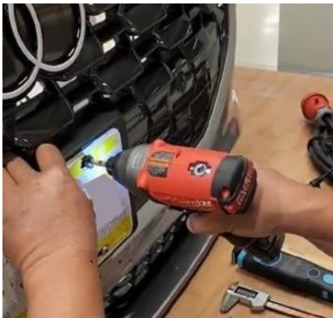
Figure 12. Installing right upper screw through the license plate and into the bracket.