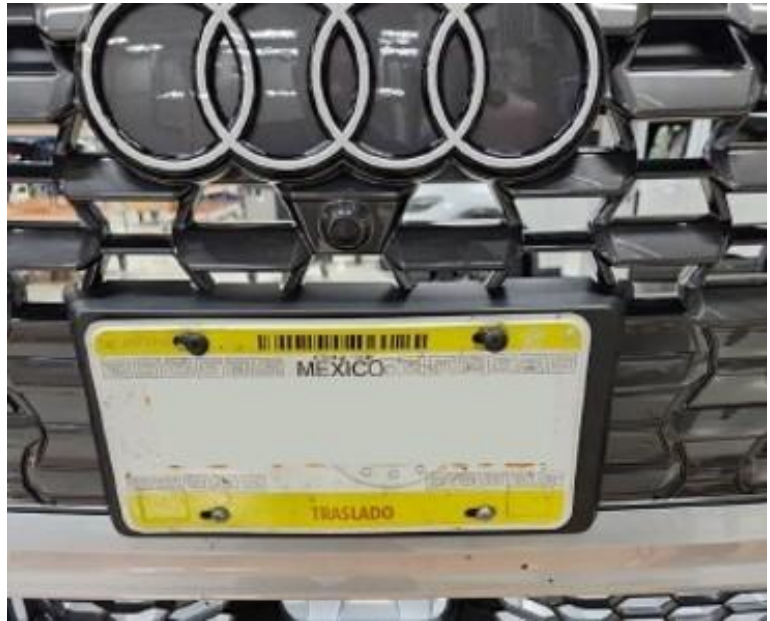
Figure 15. License plate bracket and license plate attachment completed.