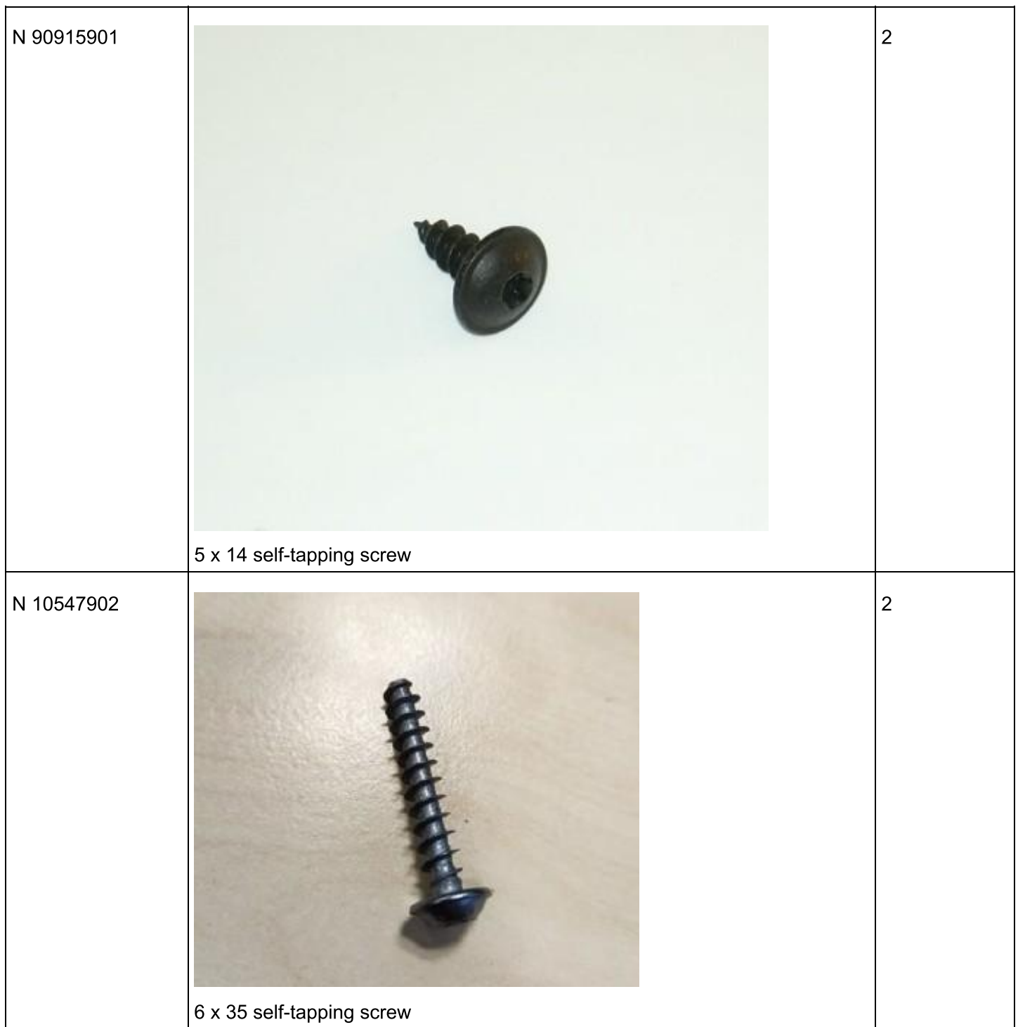
5 x 14 self-tapping screw