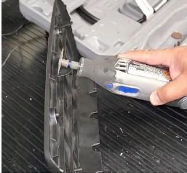
Figure 5. Lower tab removal.