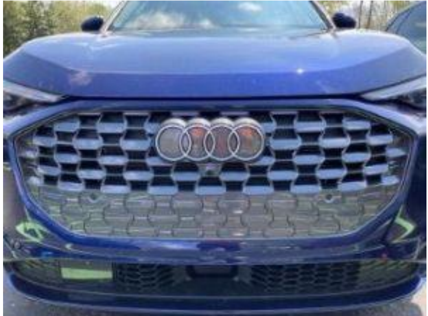
Figure 1. Incorrect grille on the Q5 with Advanced Line trim.

The front license plate bracket is missing from the vehicle. It is not present in the bei-pack, trunk area or in any other area of the vehicle.