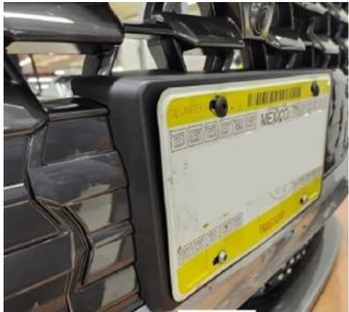
Figure 14. License plate bracket and license plate attachment completed.