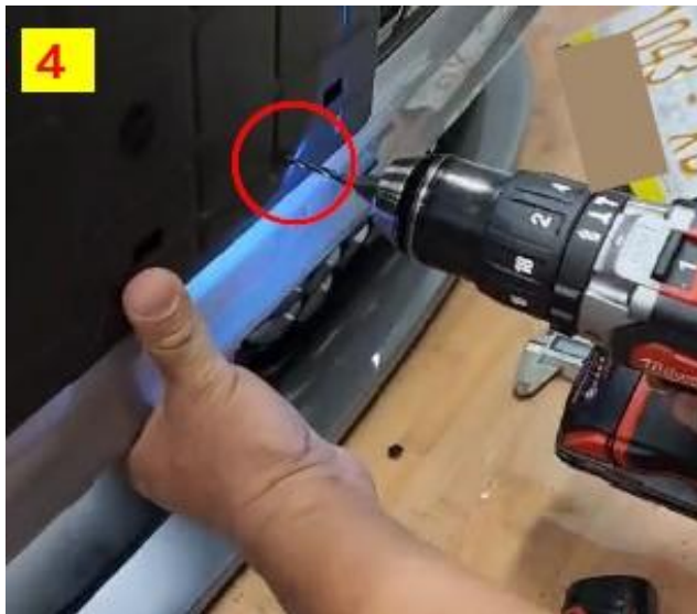
Figure 8. Drilling through the right lower hole.