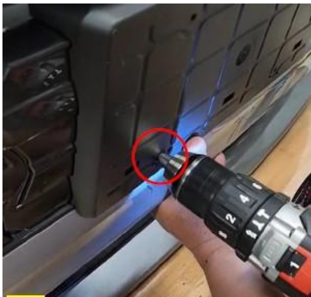
Figure 9. Drilling through the left lower hole.