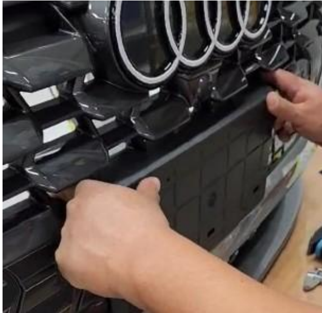
Figure 7. Test fit the license plate bracket to the grille.