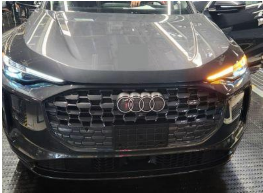
Figure 3. Correct vehicle configuration.

This error has been corrected in production where the front license plate bracket can be simply clipped to the radiator grille.