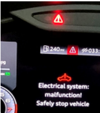
Figure 1. Warning lamp associated with message.