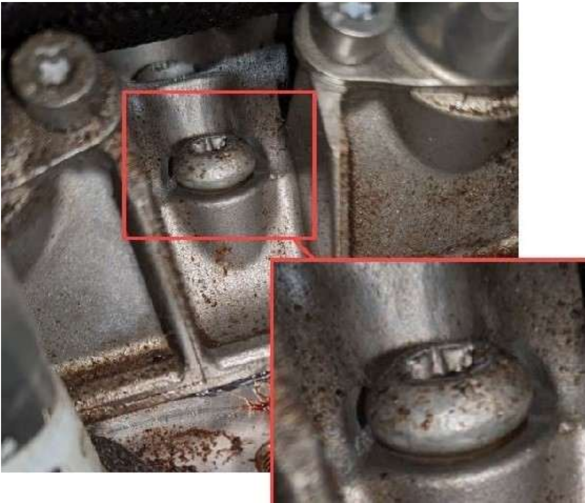
Figure 2: Oil on the threaded connection.