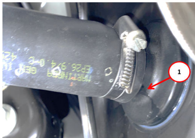
Fig. 2 Fuel Seepage