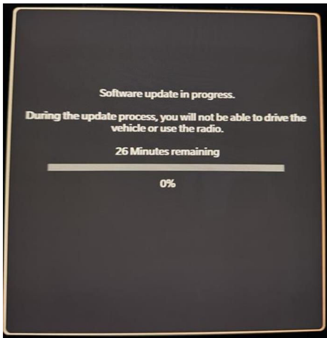
Fig. 3 Software Update In Progress