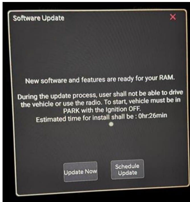
Fig. 1 Software Update Acceptance Screen