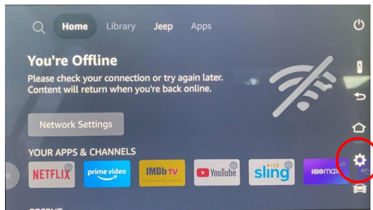
Figure 1) Select "Settings"

This can be resolved by following these steps: On one display launch the DVD player. On the other display follow the figures below.