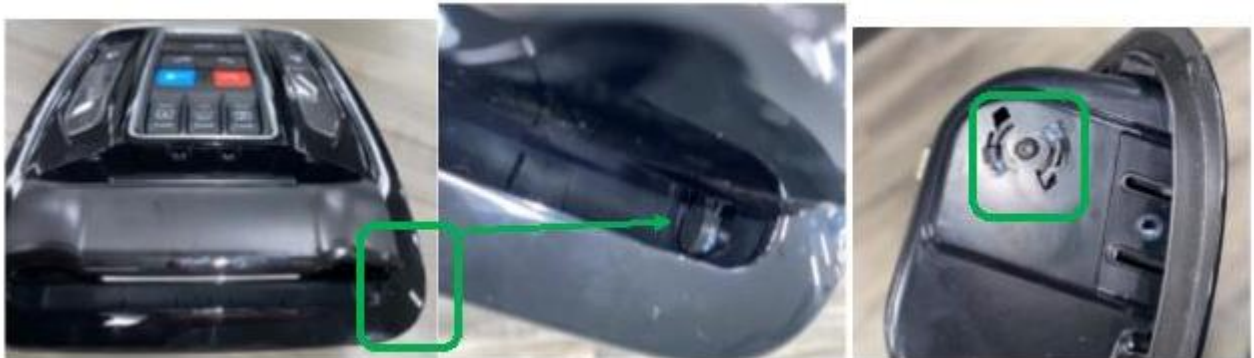
Figure 1. Locking Latch Correctly Positioned.