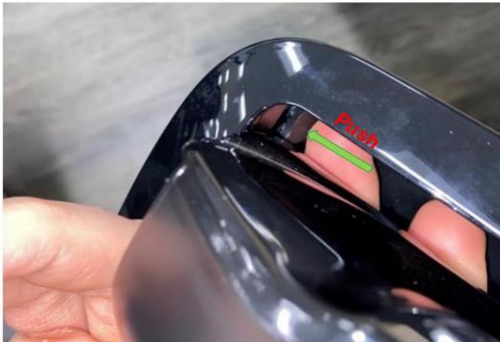
Figure 3. Pushing The Latch From The Inside To Correct The Position.

This document does not authorize warranty repairs. This communication documents a record of past experiences. STAR Online does not provide any conclusions about what is wrong with the vehicle. Rather, it captures all previous cases known that appear to be similar or related to the vehicle symptom / condition. You are the expert, and you are responsible for deciding on the appropriate course of action.