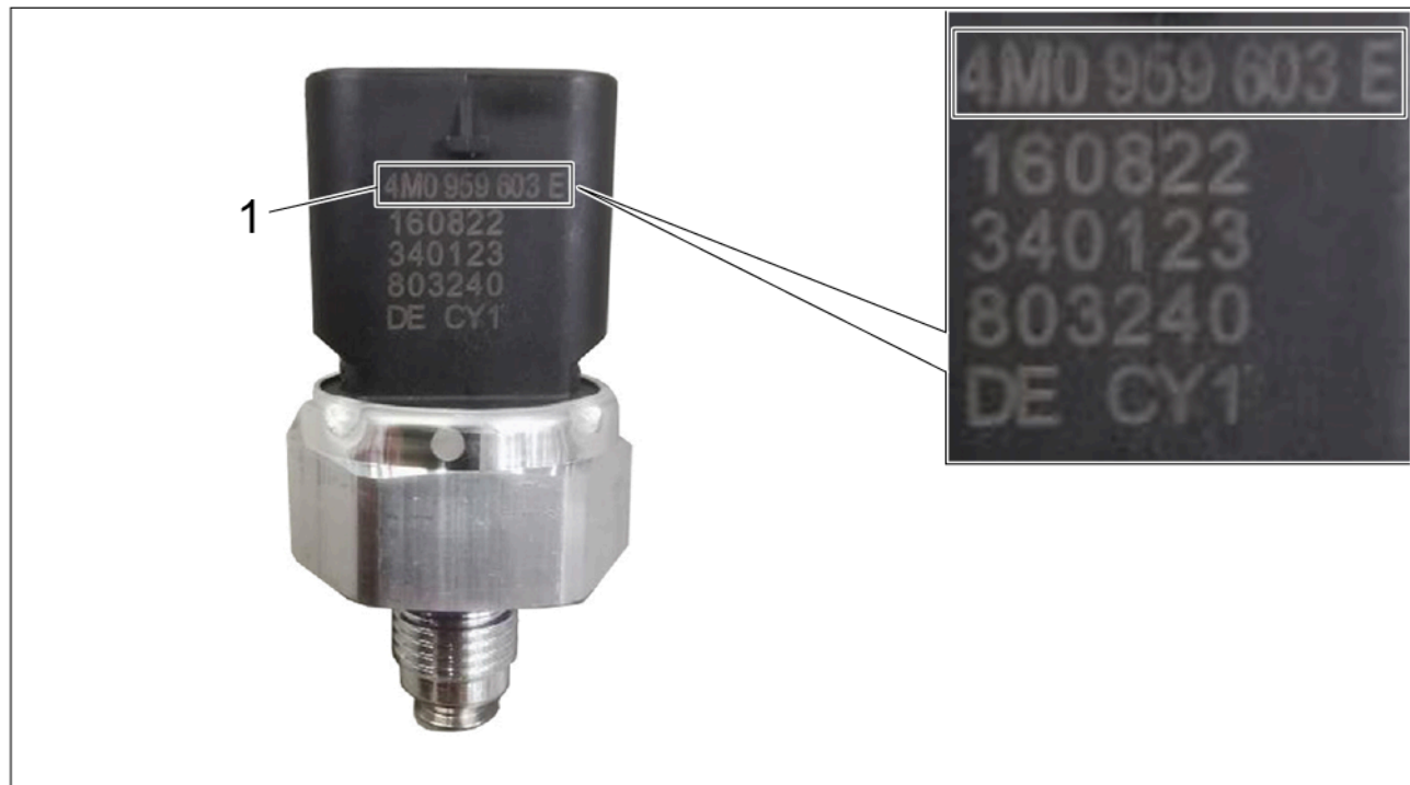
Pressure sensor part identifier