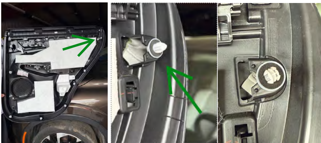
NEW Waterproof sponge