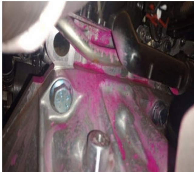
Fig. 2 Coolant Leak