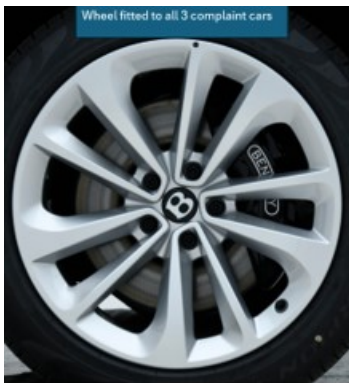
Figure 1 – 21" Twin 5 spoke (PR Code: C9N)

The issue affects specific wheel styles only (PR code related). See images below.