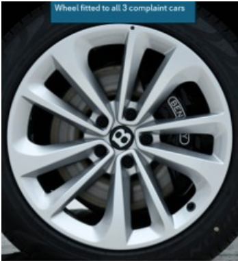
Figure 1 – 21" Twin 5 spoke (PR Code: C9N)

The issue affects specific wheel styles only (PR code related). See images below.