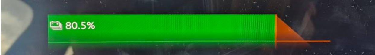
Figure 1. Charge target setting in the MMI.