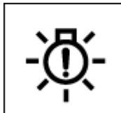
Exterior light warning light

Some vehicles equipped with the Adaptive Front lighting System (AFS) may exhibit the exterior light warning light/ exterior light warning indication on while driving or when the ignition is turned on and DTC B10A3:86 (Error signal received from swivel actuator (LH)) stored in memory.