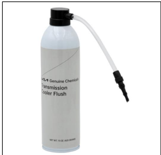
Transmission Cooler Flush can (PN UM013 CH060)

PN UM013 CH060 MUST be ordered through the Kia Chemicals website. DO NOT use aftermarket transmission cooler flush products.