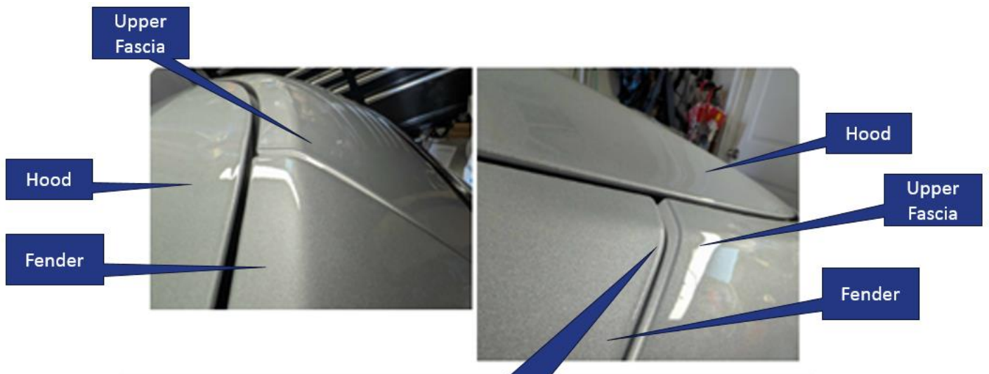
Fender to Fascia Gap/Flush Issues

Discussion: If the vehicle has a flush or gap issue, review the below information to improve fender to fascia fitment.