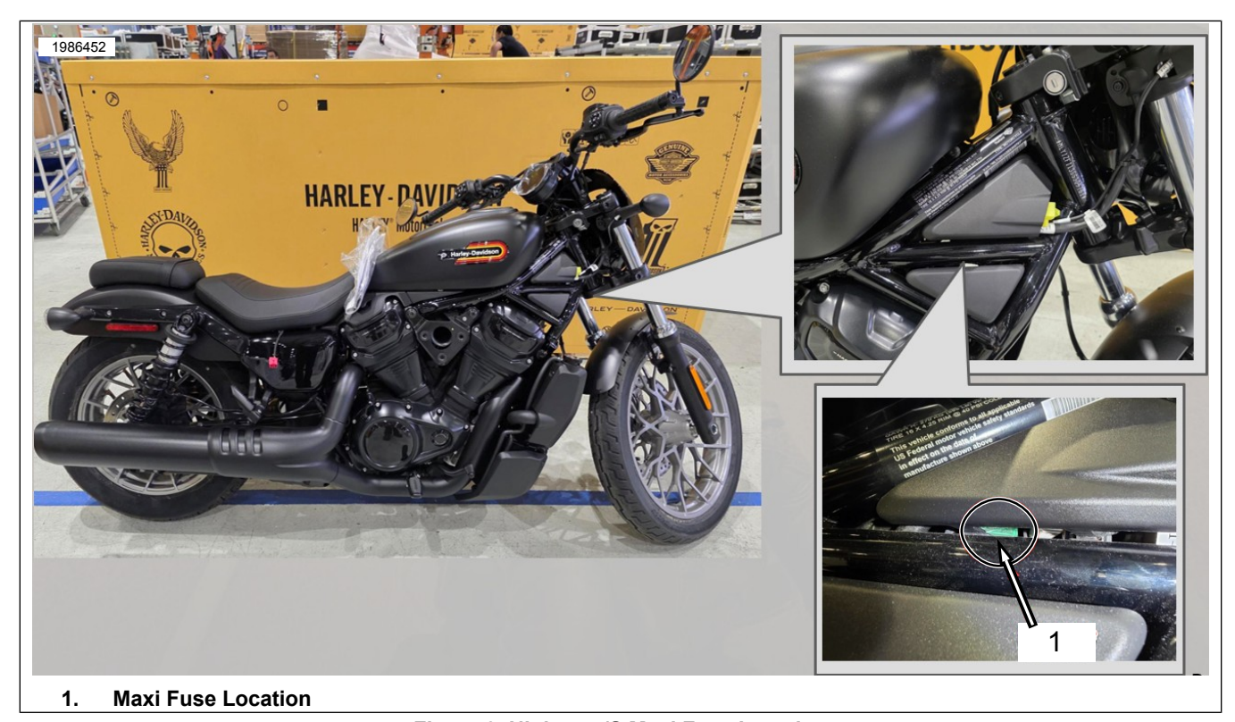
Figure 3. Nightster/S Maxi Fuse Location