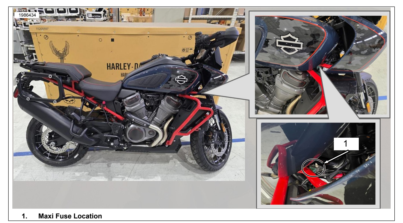
Figure 1. Pan America Maxi Fuse Location