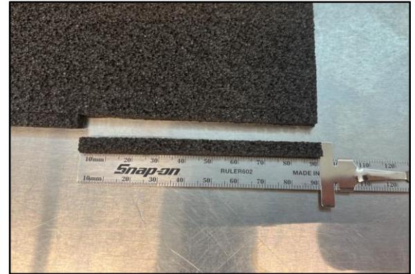
Figure 2. 90 mm x 5 mm x 5 mm EPT Foam Strip

The EPT foam sheet is already sectioned in 5 mm wide sections. It is only required to measure 90 mm in length before cutting the strip.