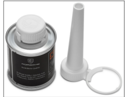
Fuel additive "Keropur"