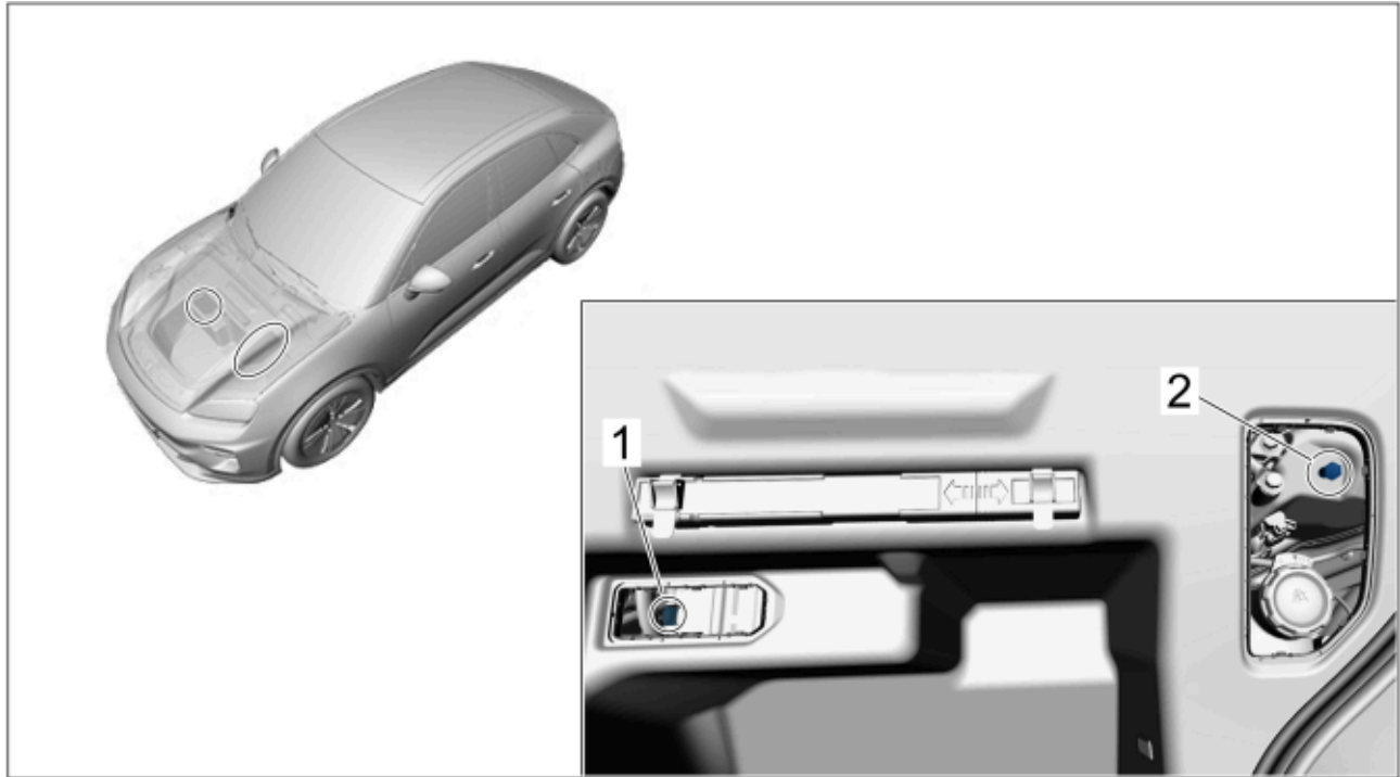
External starting points (left-hand drive vehicles)