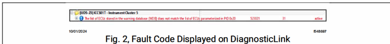
Fig. 2, Fault Code Displayed on DiagnosticLink

Figure 2 shows how the fault code appears in DiagnosticLink®.