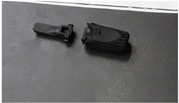
Figure 3. Broken mounting after it has been removed.

Figure 3 shows the broken mounting after it has been removed.