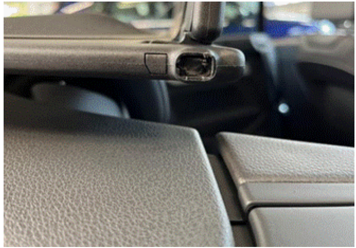
Figure 2. Broken mounting on windbreak.

Figure 2 shows the Broken mounting on windbreak.