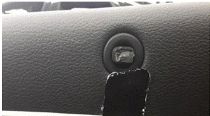
Figure 1. Remaining piece of broken mounting left in side panel.

Due to incorrect assembly of the windbreak by the customer, the windbreak is positioned too high or too low inside the mounting on the side trim after it has been inserted on one side. As a result, the possible range of motion is excessive and the wind deflector breaks.