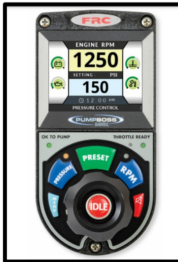
PumpBoss Max (PBA500)

FRC has made the final notice to Pierce that they will no longer be offering the legacy PumpBoss governors, they will be moving to the PumpBoss Max (PBA500). Pierce has been working with FRC to provide a smooth transition by completing our own testing and software validation in our current applications.