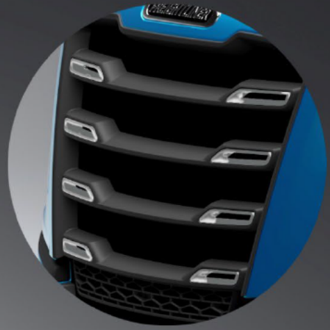
Matte Silver Inserts