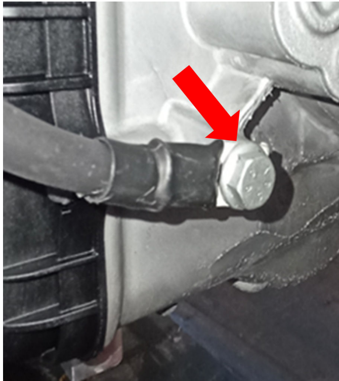
Fig. 2 G902A Ground Bolt