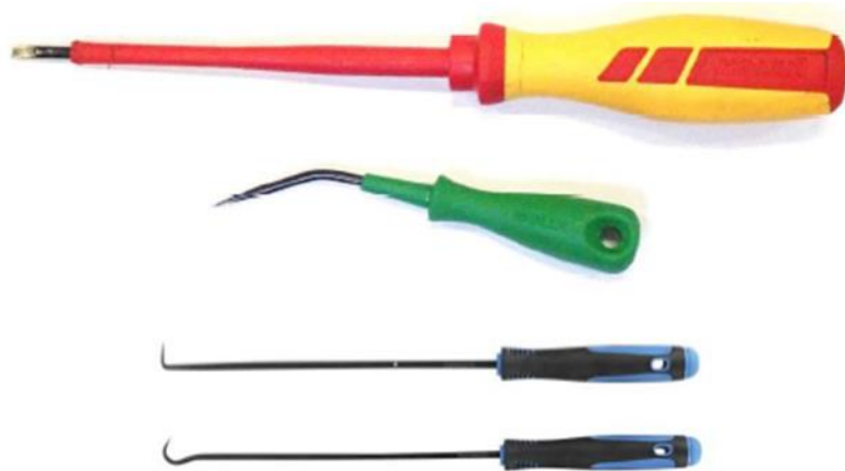
Figure 1 : Screwdriver and hook tooling for disassembly

Discussion: A review of returned parts show many parts have damage to the ball socket, spring clips, and connectors due to improper removal methods at time of servicing. Review the below information in addition to the standard remove and install detail in Service Library. Refer to Service Library 08 - Electrical / 8N - Power Systems / Power Liftgate / DRIVE UNIT, Power / Removal and Installation