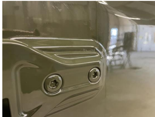
Corrosion Example (Fig. 3)

Dealers will need to take photo(s) of the affected area(s) identified during the inspection to support the repair. A clear photo of the corrosion is needed and MUST include the affected body panel. The VIN is no longer required on the photo. (Figure 3)