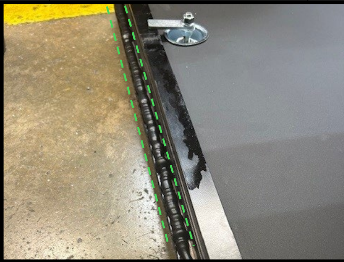
Sealant Application Example

8 – 10 Millimeters of sealant is applied around the perimeter of the compartment door. This replaced the foam seal that was being used prior to the changeover.