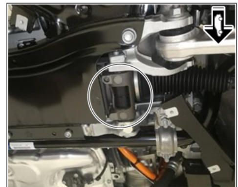
Rubber-metal mount (shown on the right side of the vehicle)