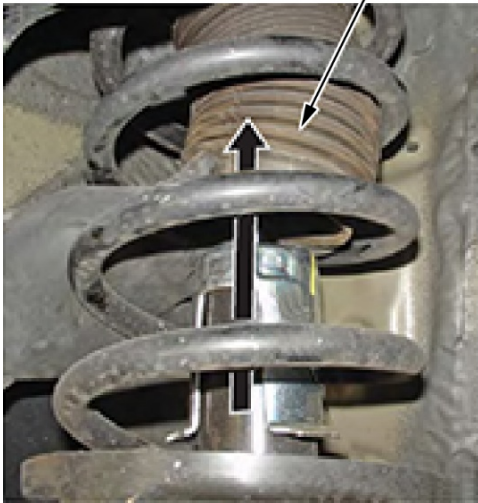
DAMPER DUST COVER