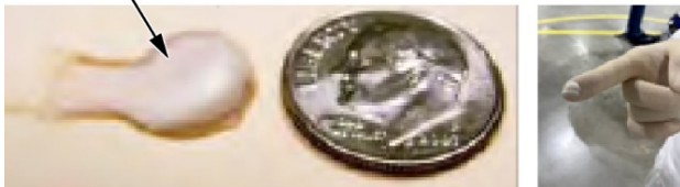
0.5 GRAM OF SILICONE GREASE

NOTE: Make sure to wipe off any grease from the shaft.