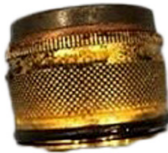
Fig. 2, Drain Hole