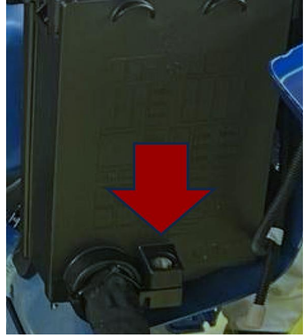
1/4 Turn Screw To Unlock Cover