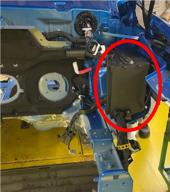
Front Power Distribution Center