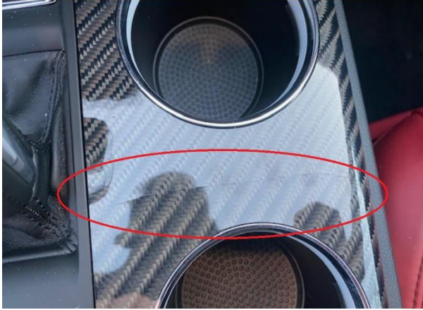
1. Sample pic. of crack presence on the Central Trim

For this reason and from now on the Cupholder, the Phone box and the Central trim are available as single spare parts for giving you the chance to replace the affected component only; then in case of warranty requests, whenever it's possible, they MUST be singularly ordered instead of the complete Central Tunnel Moulding. Warranty Claims differently managed than these Circular Letter instructions will be subject to further review.