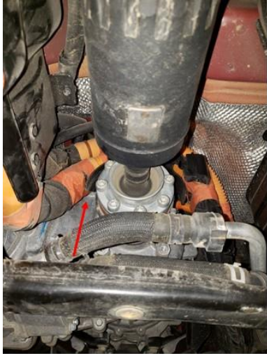
PIM to P2 wire Possible rub point

Inspect PIM to P2 wiring harness for rub through or damage near the transmission driveshaft CV joint shield.