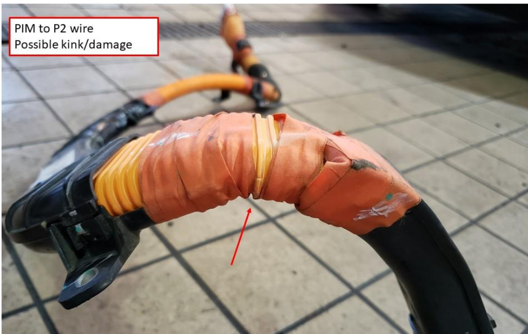
PIM to P2 wire Possible kink/damage

This document does not authorize warranty repairs. This communication documents a record of past experiences. STAR Online does not provide any conclusions about what is wrong with the vehicle. Rather, it captures all previous cases known that appear to be similar or related to the vehicle symptom / condition. You are the expert, and you are responsible for deciding on the appropriate course of action.