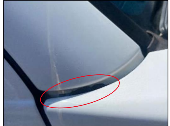
Figure 4. Paint Peeling on A-pillar